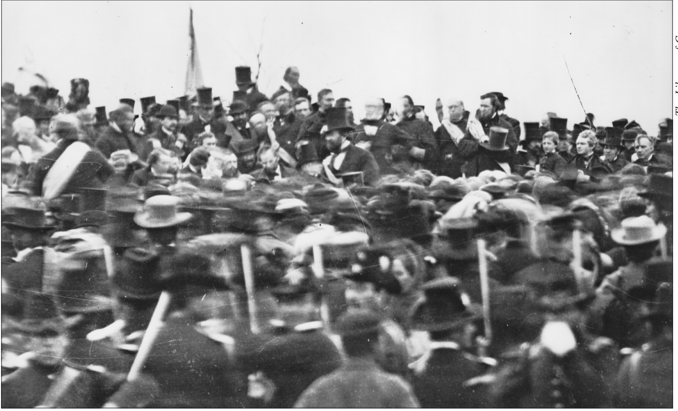
The Library of Congress